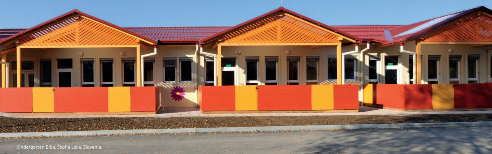
Kindergarten Biba, Škofja Loka, Slovenia