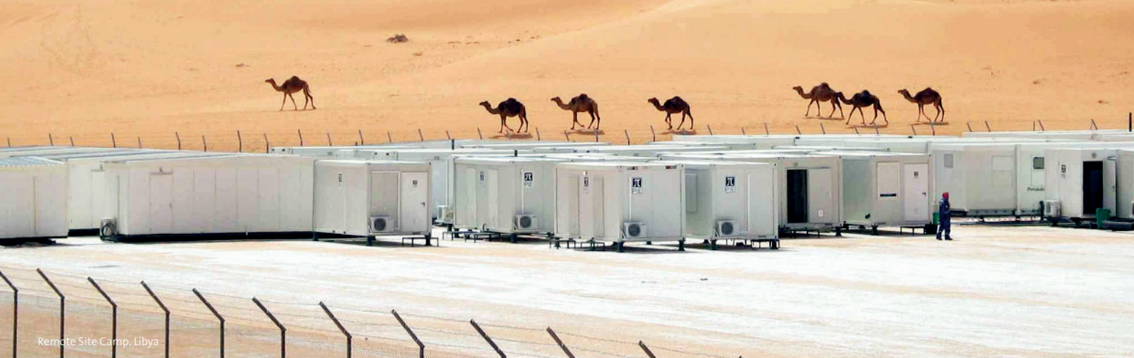
Remote Site Camp, Libya