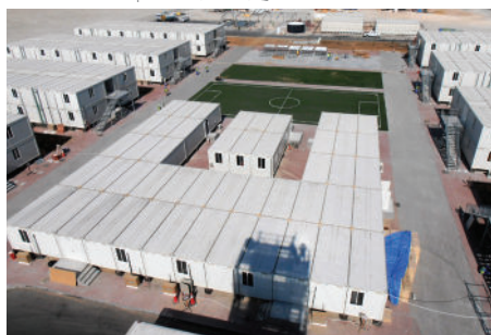
Oil Rig Field Camp Support, Hassi Messaoud, Algeria